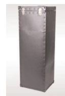
Wheeled Budget linear case - AC504